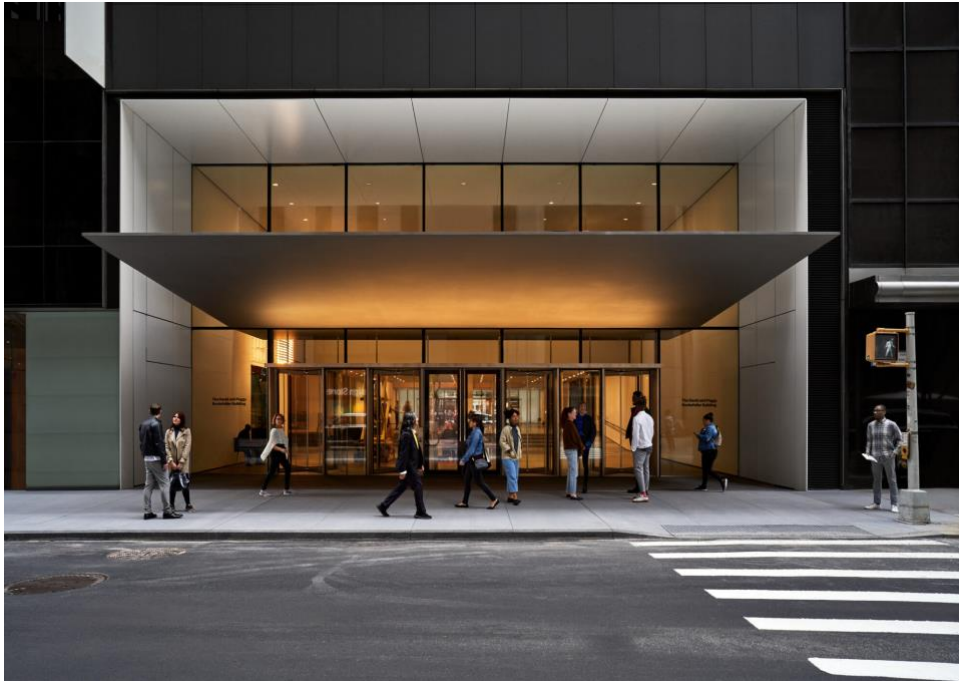
The Museum's main entrance on West 53rd Street.